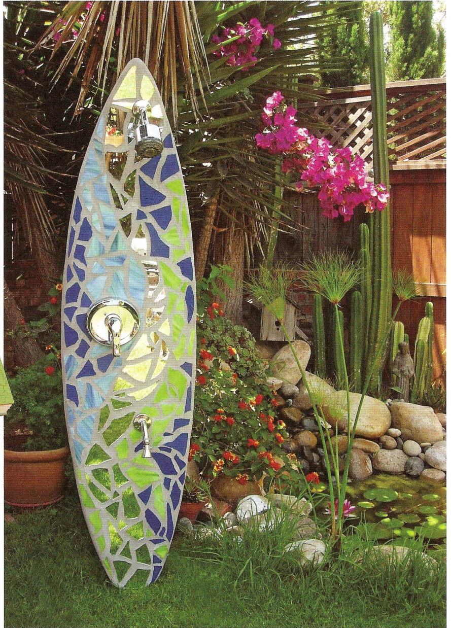
SURFBOARD PHOTO BY PAUL MOLAK

If you have trouble remembering what you did last year to make those hard-to-grow tomatoes turn out so well, or where you purchased that unusual mix of desert wildflowers, The Gardeners Journal can help you keep track. Detail your planting, fertilizing and watering activities, along with other observations, on recycled notebook paper. Available in two sizes at journalsunlimited.com .